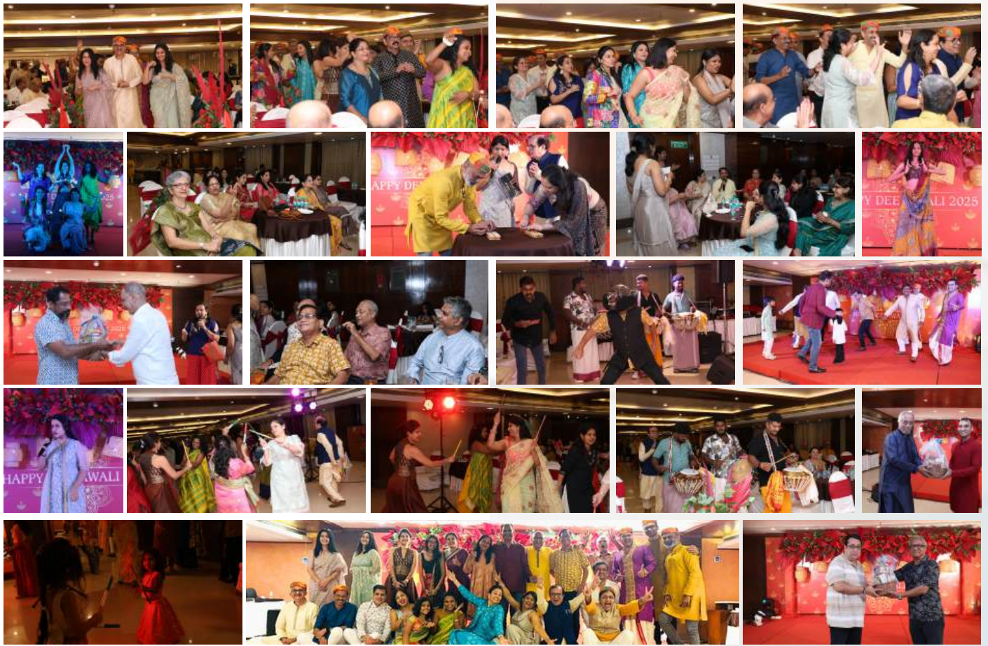
Glimpses from a night full of lights, laughter & togetherness